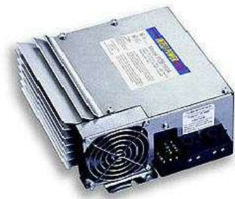
Solid State Converter

In recent years the needs of RV's have changed. We are seeing more sophisticated electronics on board, many appliances are using more sophisticated electronic control boards to control the functions of these appliances and require very clean regulated DC power to operate properly.