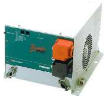
Combination Inverter/Converter Hard Wired – Modified Sine Wave